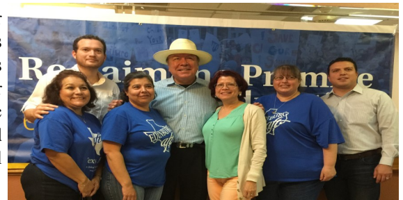
Members at the Legislative Breakfast

The legislators met AFT's requests with open ears and a promise to work hard to push our priorities come January. They also reminded those present, that participation by teachers