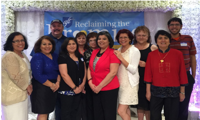
Members at the Christmas Social